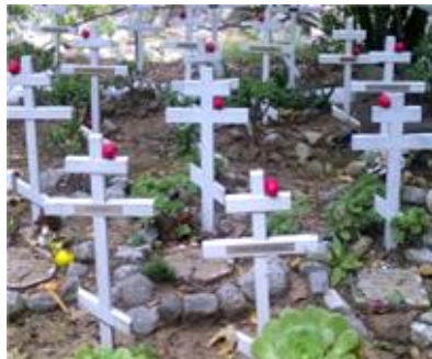
Christ is risen! Infant graves decorated with red Pascha eggs for the Day of Rejoicing (Radonitsa).